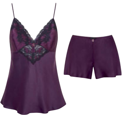
Cami and short set £40