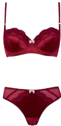
Bra £20 Briefs £10.50