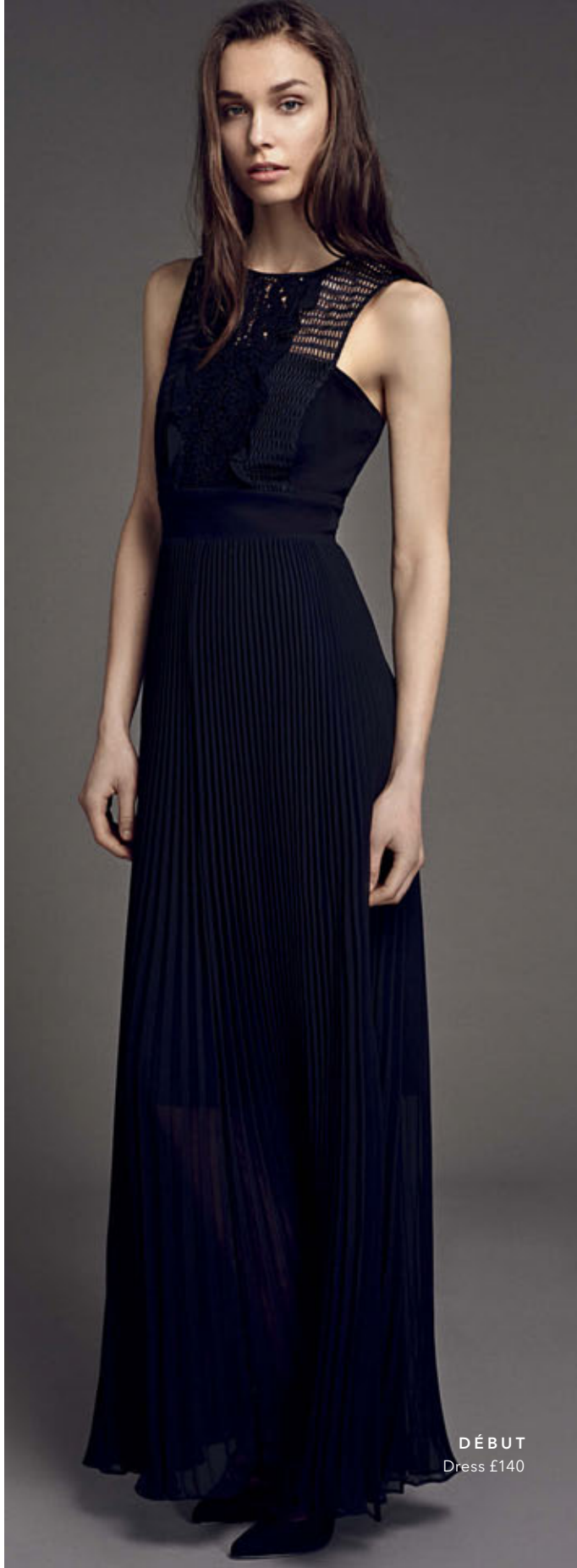
DÉBUT Dress £140