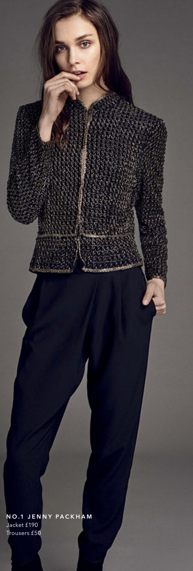
NO.1 JENNY PACKHAM Jacket £190 Trousers £50