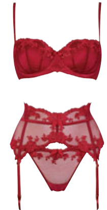
Balcony bra £28 Suspender £22.50 Thong £14.50