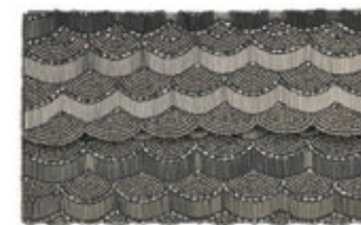
Scalloped clutch £45