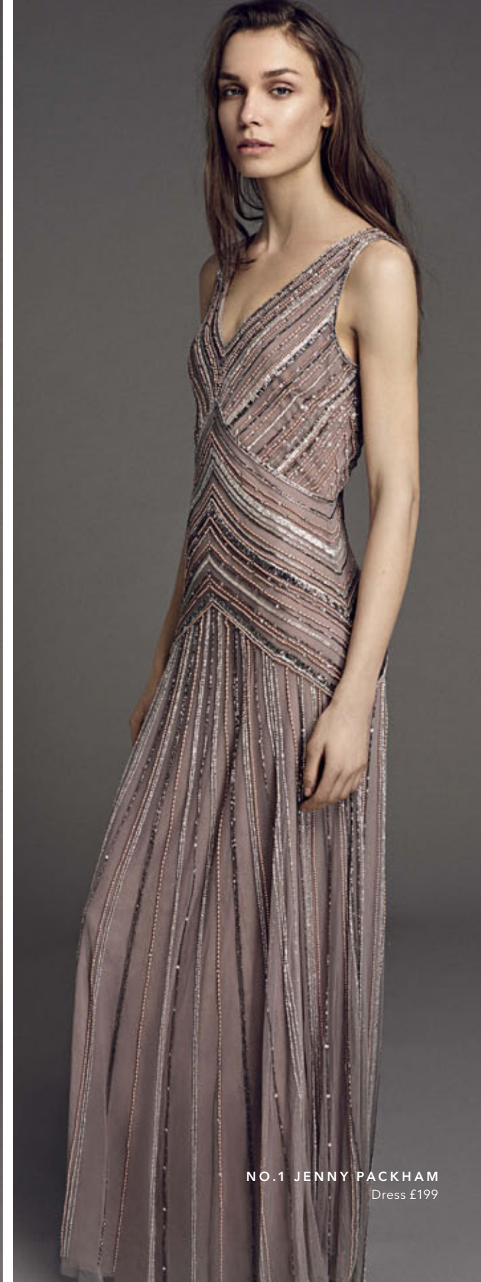
NO.1 JENNY PACKHAM Dress £199