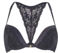
Bra £36.50 Briefs £18.50