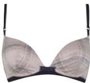
Bra £22.50 Brazillian £12.50