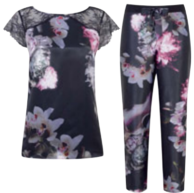
Floral top £20 Floral bottoms £26