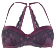
Glamour bra £28 Brazillian £15