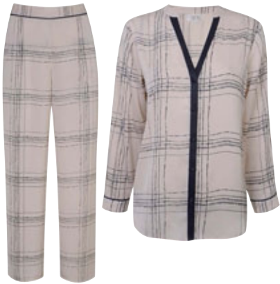
Satin shirt £25 Satin bottoms £25