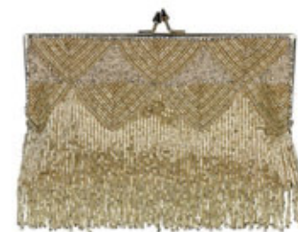
Fringe clutch £60