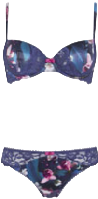
Bra £25 Briefs £12.50