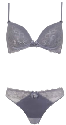
Plunge bra £16.50 Hipster briefs £8.50