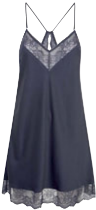
Satin chemise £26