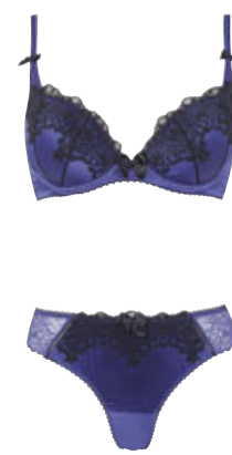
Satin plunge bra £22.50 Satin thong £10.50