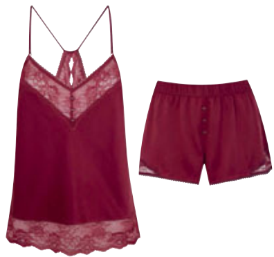
Satin cami £18.50 Satin shorts £18.50