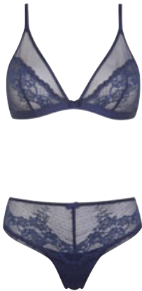
Floral lace bra £18.50 Floral lace bottoms £10.50