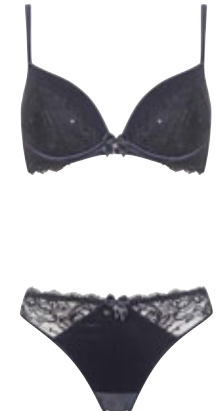
Plunge bra £18.50 Hipster briefs £10.50