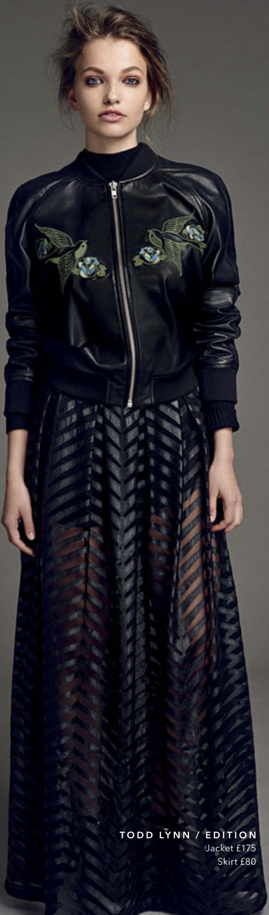
TODD LYNN / EDITION Jacket £175 Skirt £80