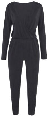
Slinky jumpsuit £55