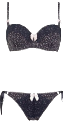
Spot bra £20 Spot briefs £10.50