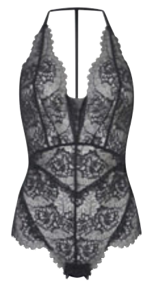
Lace body £36