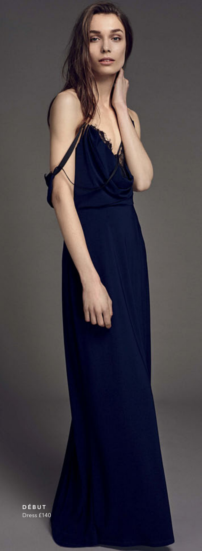
DÉBUT Dress £140