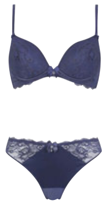
Glitter plunge bra £16.50 Glitter hipster £8.50