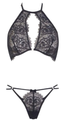
Lace halter £26 Brazilian £15