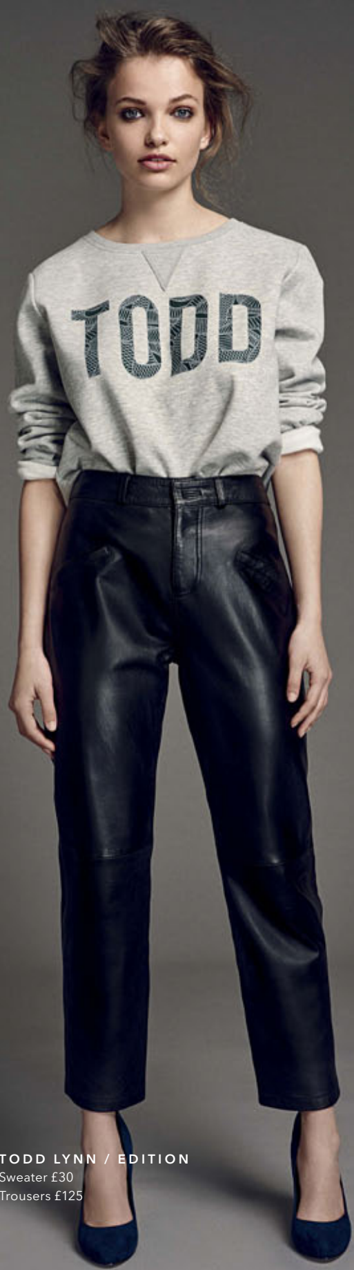
TODD LYNN / EDITION Sweater £30 Trousers £125