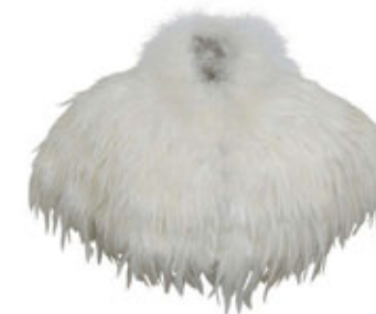
Feather shrug £50