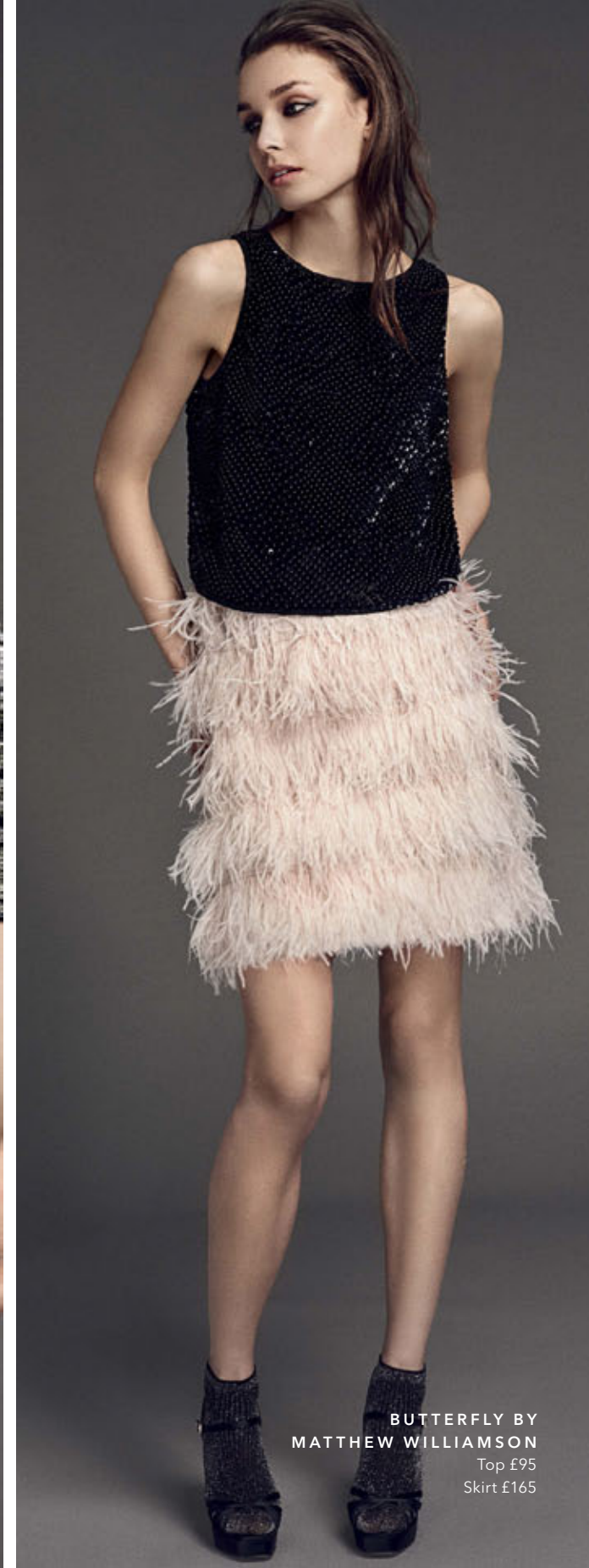
BUTTERFLY BY MATTHEW WILLIAMSON Top £95 Skirt £165