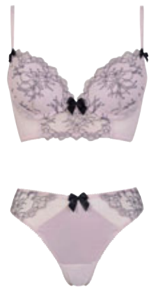
Bow longline bra £22.50 Bow Brazilian £10.50