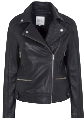
Leather jacket £250