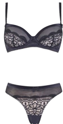
Bra £28 Briefs £15