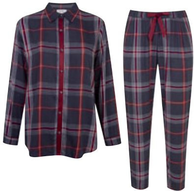
Check shirt £25 Check bottoms £25