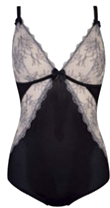
Lace body £28