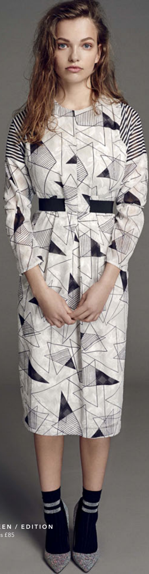
PREEN / EDITION Dress £85