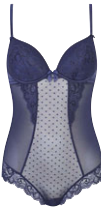
Spotmesh body £22.50