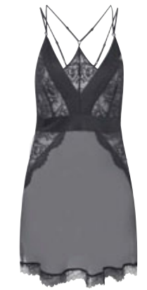
Strappy chemise £40