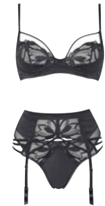
Bra £30 Suspender £18.50 Brazilian £15