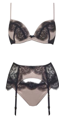
Plunge bra £26 Suspender £18.50 Brazilian £14.50