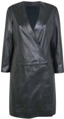
Leather dress £150