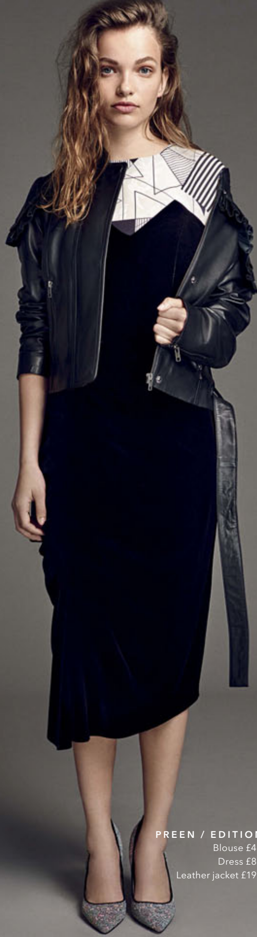
PREEN / EDITION Blouse £48 Dress £85 Leather jacket £190