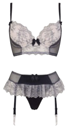
Lace longline bra £22 Frilly thong £12.50