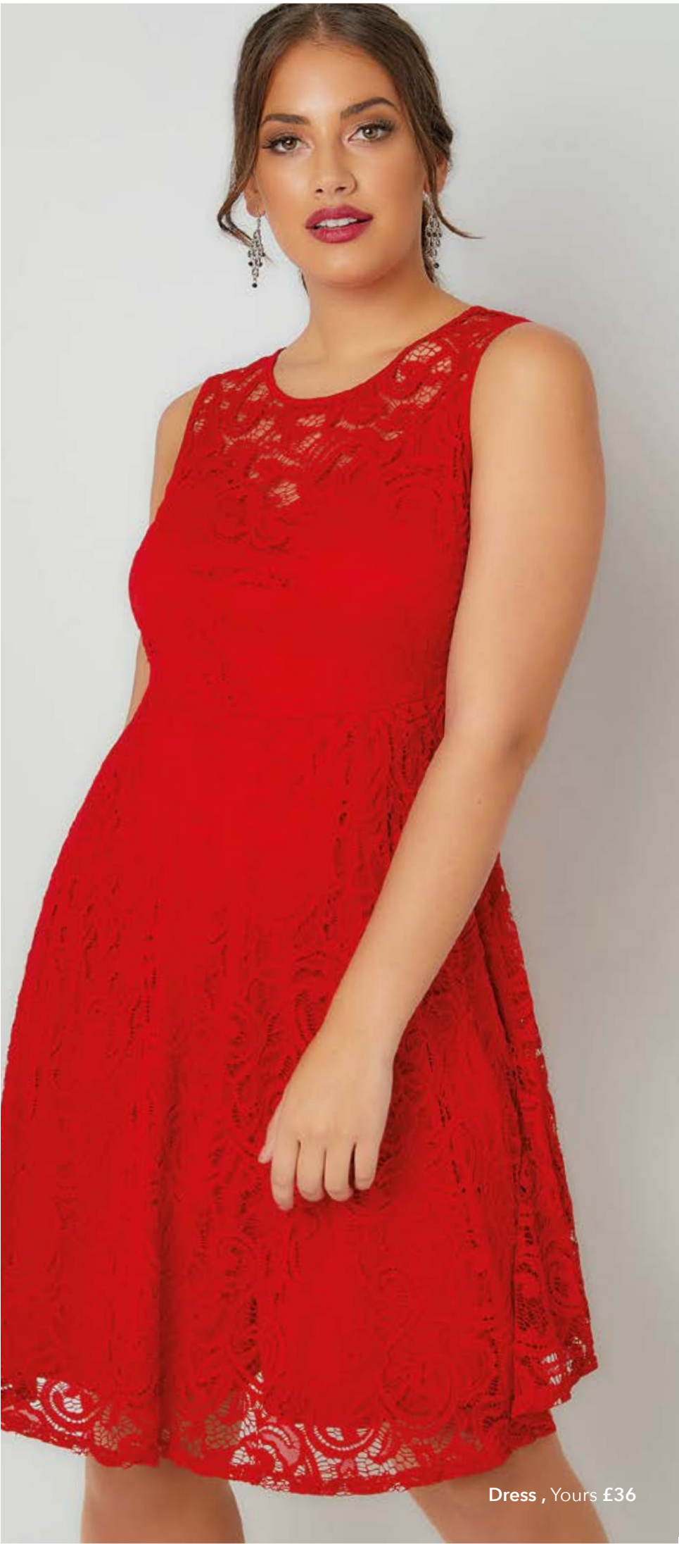
Dress , Yours £36

Phase one of the new, upsized H&M store now open at The Grafton!