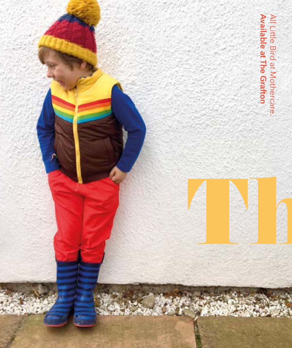
All Little Bird at Mothercare. Available at The Grafton